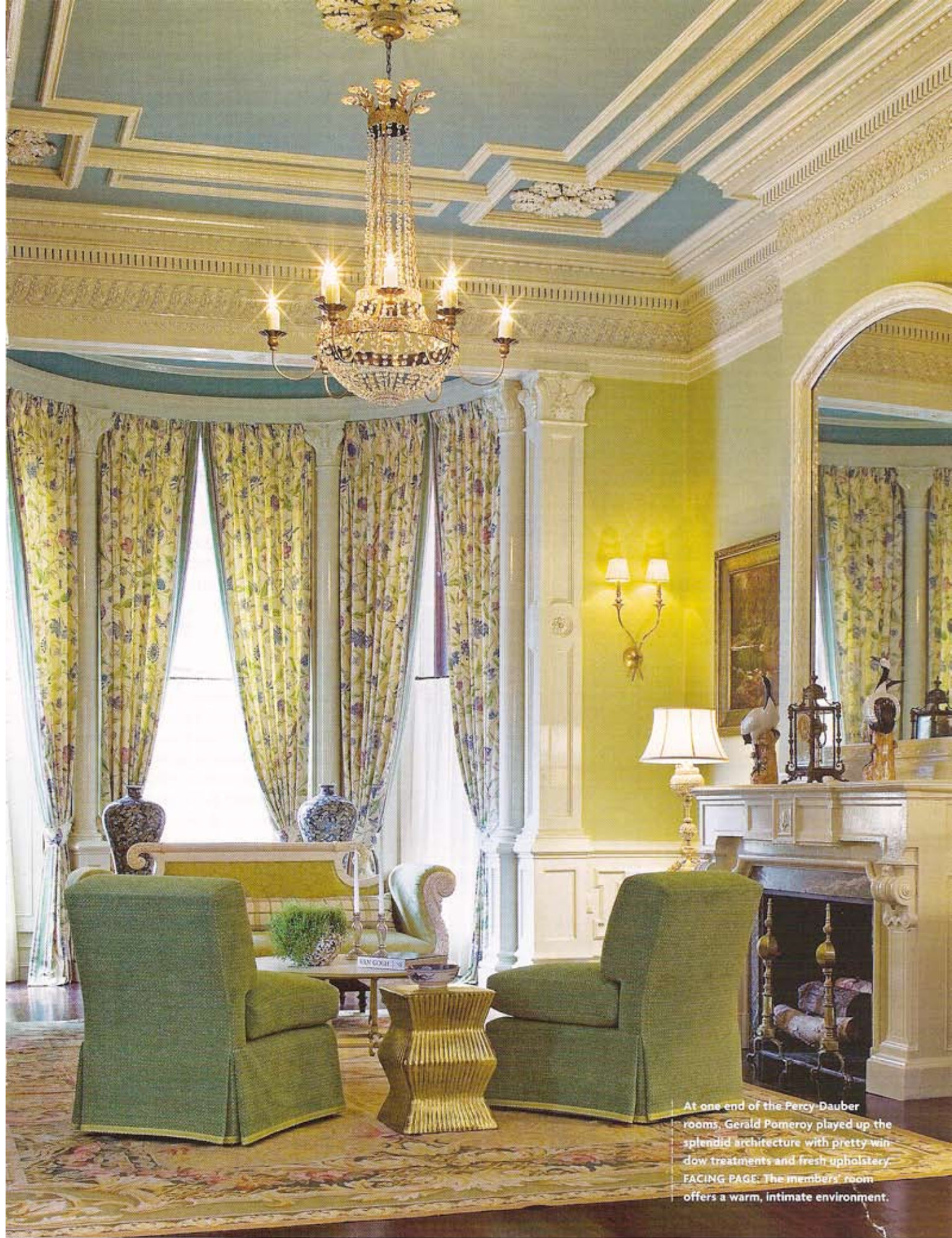
At one end of the Percy Dauber rooms, Gerald Pomeroy played up the splendid architecture with pretty window treatments and fresh upholstery. FACING PAGE: The members' room offers a warm, intimate environment.