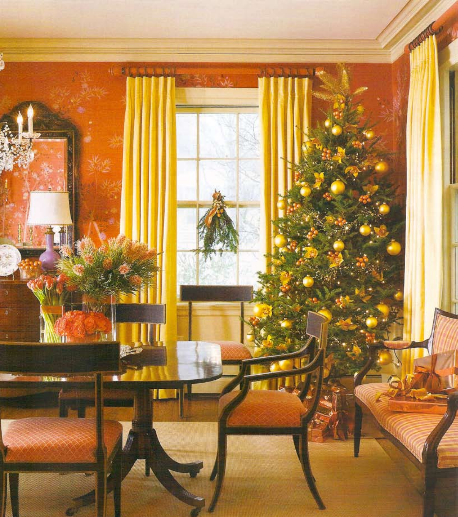
In the dining room, shiny gold raw silk descends in simple gathered panels at the windows, a lavish accent against vibrant coral walls. Opposite top: Fresh flowers are a colorful surprise in the dining room. Orchids fashioned into topiaries stand high on the mantel; other flowers are tucked among glass ornaments on the Christmas tree. Opposite bottom: The wide central hallway, with its pretty sofa and elaborate window treatments, provides additional seating during convivial holiday gatherings.